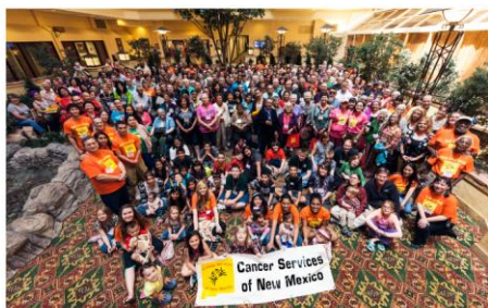
Cancer Services of New Mexico's Spring 2014 Family Cancer Retreat May 2-4, 2014 - Albuquerque, NM

We also distributed over 400 copies of our Cancer Treatment Organizer statewide. This free recordkeeping tool designed by a New Mexican cancer survivor offers a simple system for keeping cancer-related records organized and easily accessible. In addition, our dedicated LIPA website – www.NMCancerHelp.org – includes links to close to 100 resources to assist those coping with cancer-related legal, insurance, or financial issues.