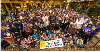
Cancer Services of New Mexico's Fall 2014 Family Cancer Retreat September 12-14, 2014 - Albuquerque, NM

Cancer Services of New Mexico - P.O. Box 51735 - Albuquerque, NM 87181-1735 - (505) 258-9583 - www.CancerServicesNM.org