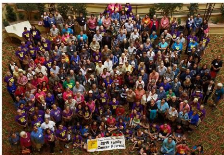
Cancer Services of New Mexico's Fall 2015 Family Cancer Retreat September 11 - 13, 2015 - Albuquerque, NM

We continued to offer our Family Cancer Retreat twice a year in 2015, with over 500 people from more than 260 New Mexican families attending these free programs in April and September. This is the largest general cancer education program in New Mexico, and the largest program of its type in the U.S. Each three-day retreat focuses on educating New Mexico's adult cancer patients/survivors and their loved ones on the process of surviving, from the difficulties of handling the initial diagnosis, through coping with therapy, through a variety of medical and social challenges relating to at-home care and the emotional issues associated with surviving.