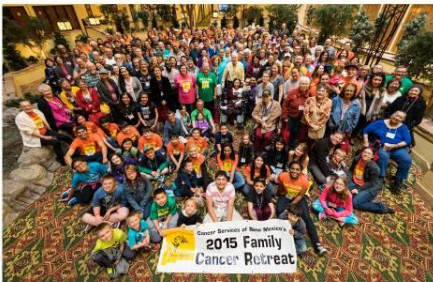
Cancer Services of New Mexico's Spring 2015 Family Cancer Retreat April 17-19, 2015 - Albuquerque, NM

Our Family Cancer Retreats received national recognition in 2015 as winner of the Cancer Patient Education Network's Excellence in Patient Education Award. This award recognizes individuals or programs that use creative approaches to develop and/or disseminate patient education. Our work was singled out at the top offering from a national slate of nominees, and we are very proud and thankful for this distinction!